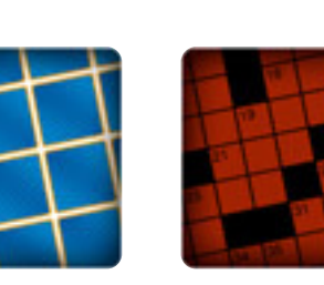
Ice Cream Irregular Blast Sudoku